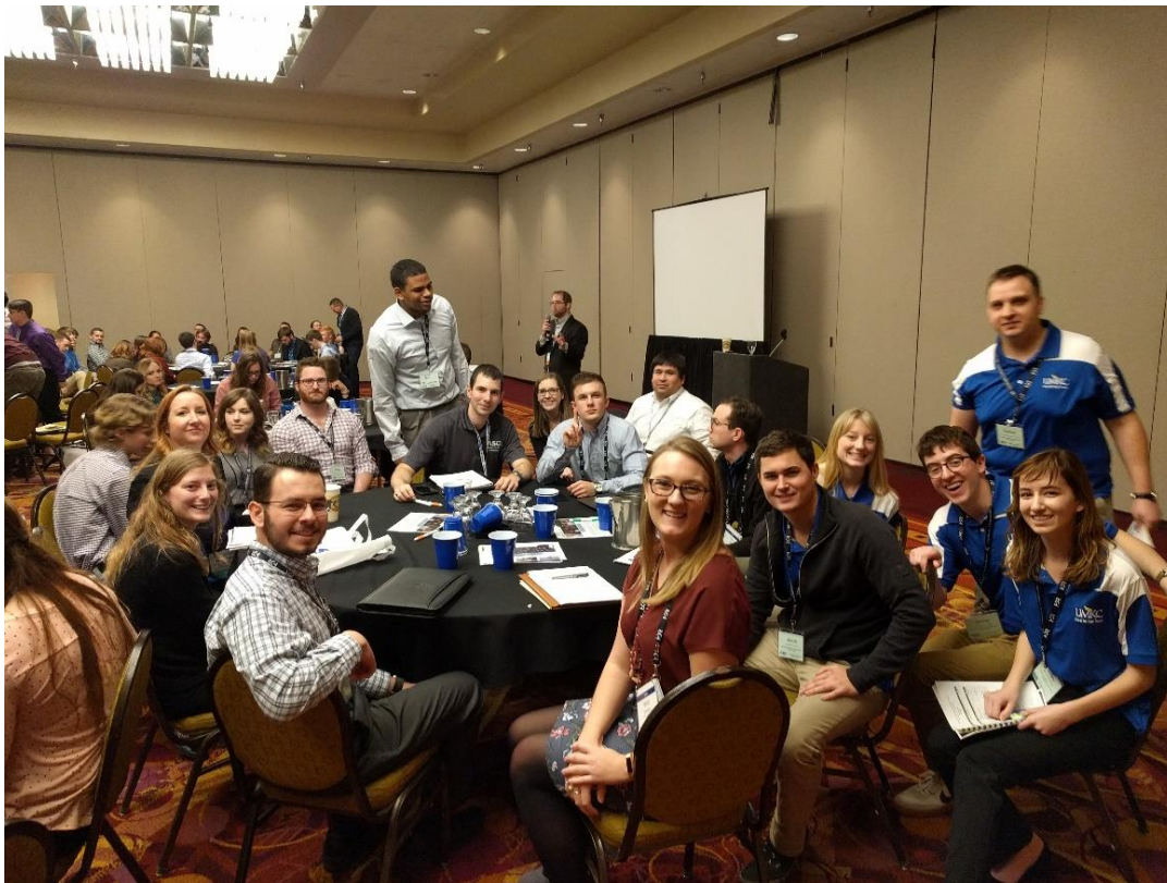
KC ASCE Members at the Region 7 Breakout Session with UMKC and Missouri State University Students.